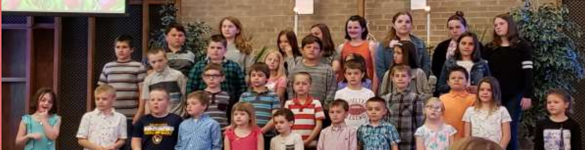
Sunday School Students final performance of the school year on Mother's Day, May 12th.