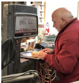
2) Cut shape with band saw