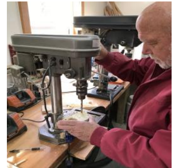
5) Drill axle holes and assemble