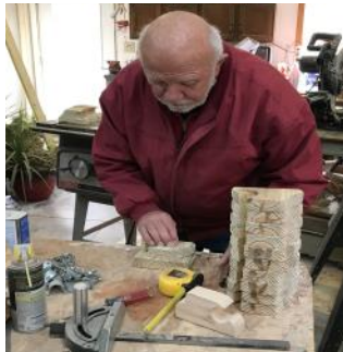
1) Cut wood and trace pattern

Since Lee has more projects than we have space to feature here, be sure to follow Trinity Shoebox Project on Facebook for more details and photos!