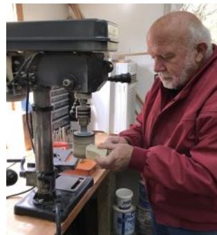
4) Sand body of car