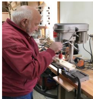
3) Drill windshield hole