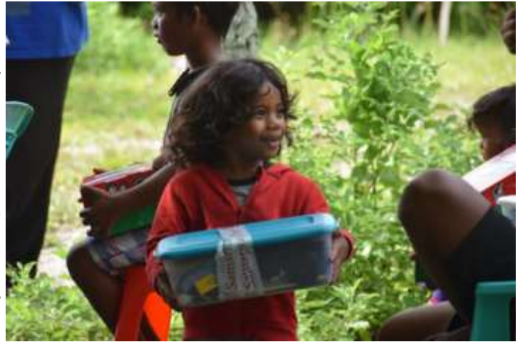
WONDER FILLS THE EYES OF CHILDREN AS THEY AWAIT OPENING THEIR SHOEBOX GIFTS!

Operation Christmas Child outreach events in the Marshall Islands are part of a broader Pacific Islands initiative in which Samaritan's Purse is seeking to reach 500,000 children on 1,000 Pacific islands with a gift-filled shoebox and a presentation of the Gospel of the Lord Jesus Christ.