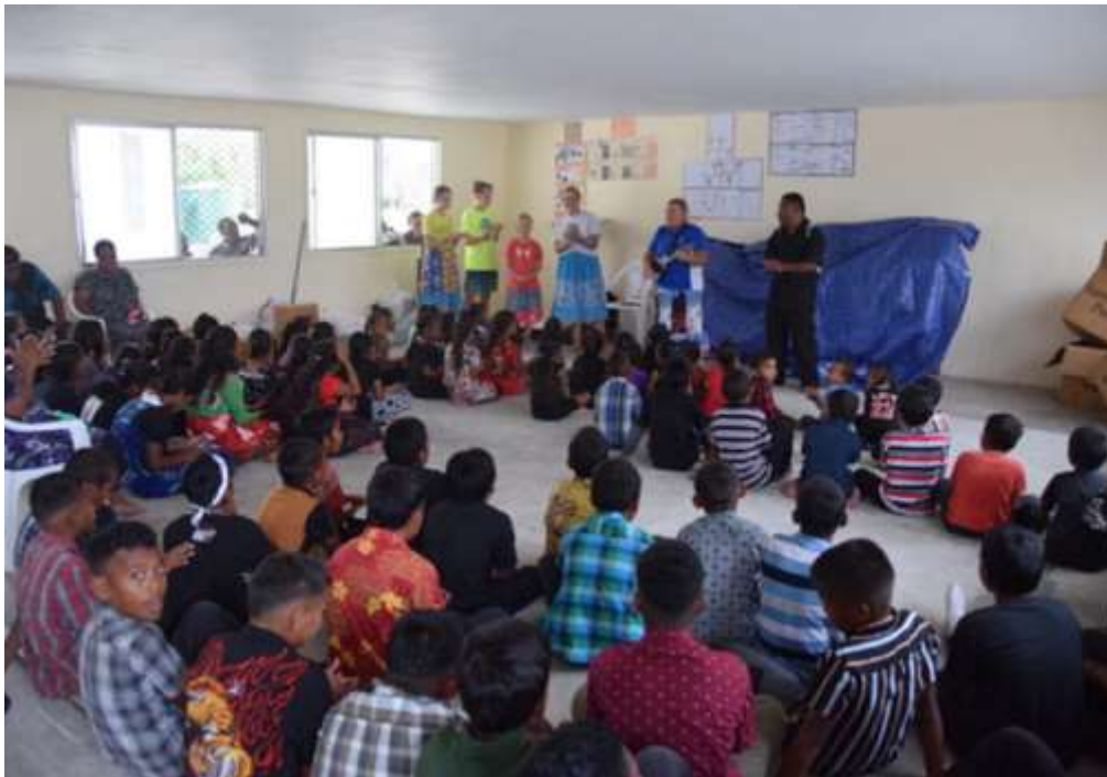
A MISSIONARY TEAM FROM THE MARSHALL ISLANDS HOSTS AN OUTREACH EVENT TO PRESENT THE GOSPEL TO CHILDREN OF THE KWAJALEIN ATOLL.