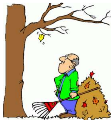
LEAF PICK UP

The trustees are looking for volunteers with riding lawn mowers to help much or bag leaves at the church and parsonage in the coming weeks.